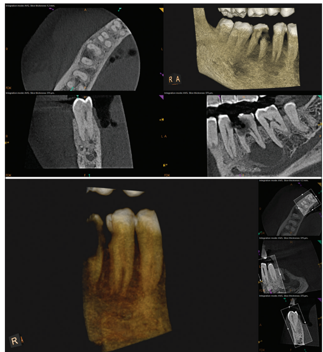
Figure 2: CBCT image showing 3 roots in the right mandibular 2 nd premolar.

The unpredictability of the root canal system represents a challenge to both endodontic diagnosis and also for further treatment. The primary step in root canal treatment is the identification of the internal morphology and this can