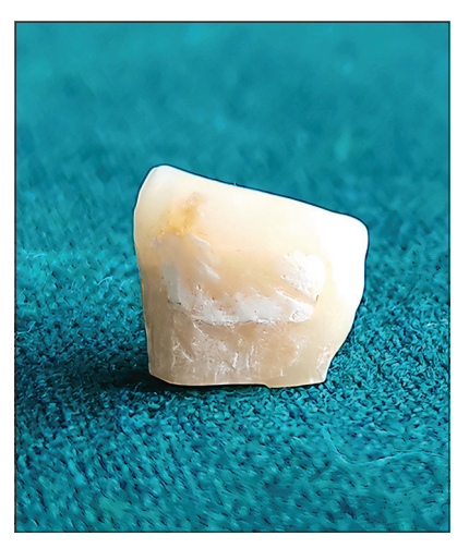
Figure 1: White opaque discoloration over the surface of the resin composite restoration.

result in easier staining over time.<sup>[16]</sup> These might be the reasons for the higher percentage of staining of RMGIC and composites in the present study.